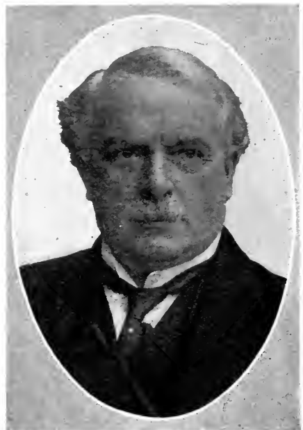
The Rt. Hon. D. LLOYD GEORGE, O.M., M.P.